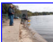
Eric's boat launched