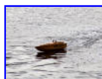
Nicely under way to grab first place in this heat