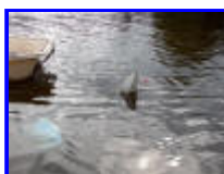
Mick in self destruct mode!